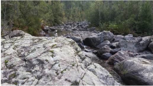
Station Aval prise