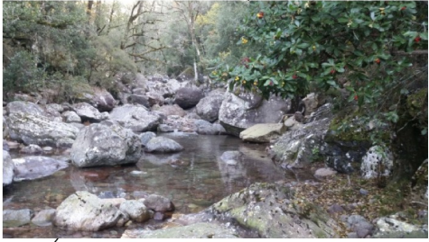
Station Amont prise