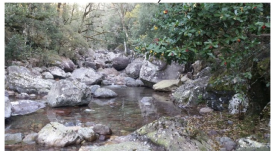
Station Amont prise